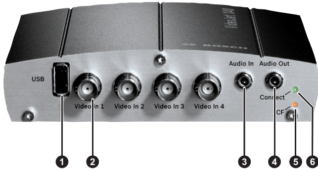
VideoJet X40 SN—front